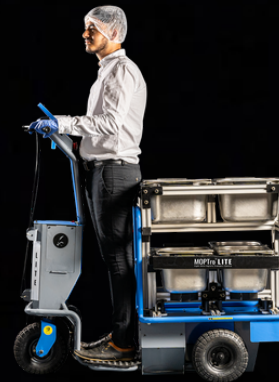
FOOD & BEVERAGE DELIVERY