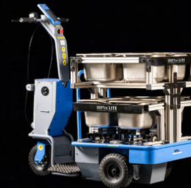
FOOD & BEVERAGE DELIVERY